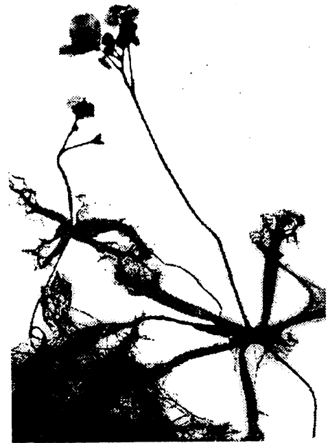
Utricularia radiata (left) and U. inflata (right), the small and large floating bladderworts. Both are now known to occur in New York State.

Apparently plants of this southeastern Coastal Plain species don't set fruit so far north; it will be interesting to go back and see if they fruit this year, but it may be that the species has recently immigrated and is not yet adapted to our short season.