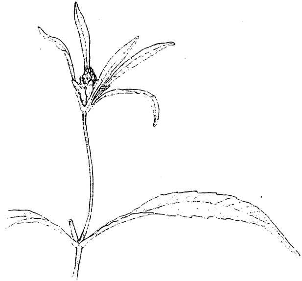
Bidens bidentoides (Nutt.) Britt. Estuary beggarticks – a rare plant found on the shores of Schodack Island State Park

The major forested community that we encountered on the island, was a "dredge spoil forest". This community is not described as such in