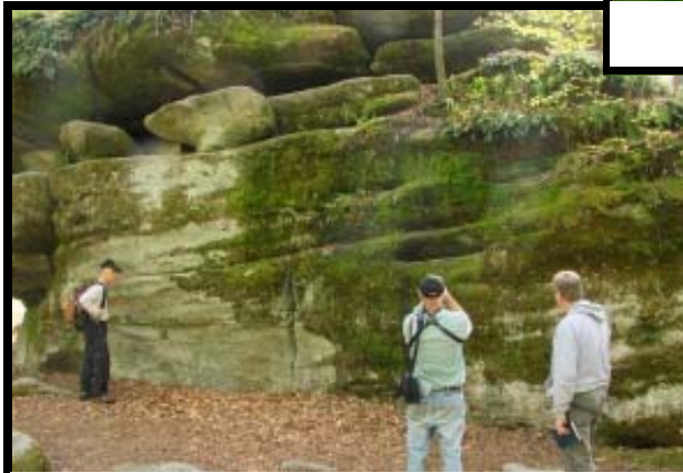
Looking for Trichomanes at Thunder Rocks.