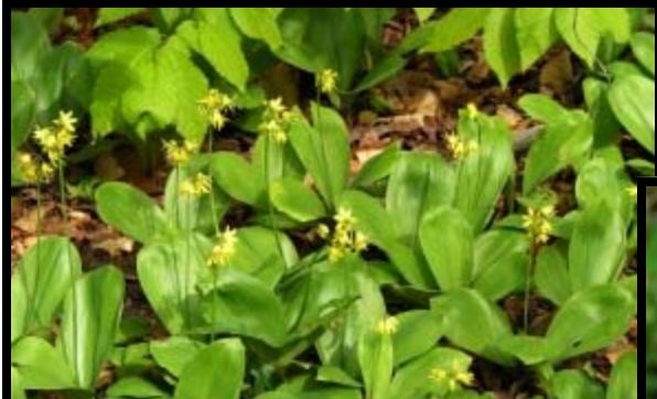
Clintonia borealis was very common and in full flower. We had hoped to see Clintonia umbellata but no luck.