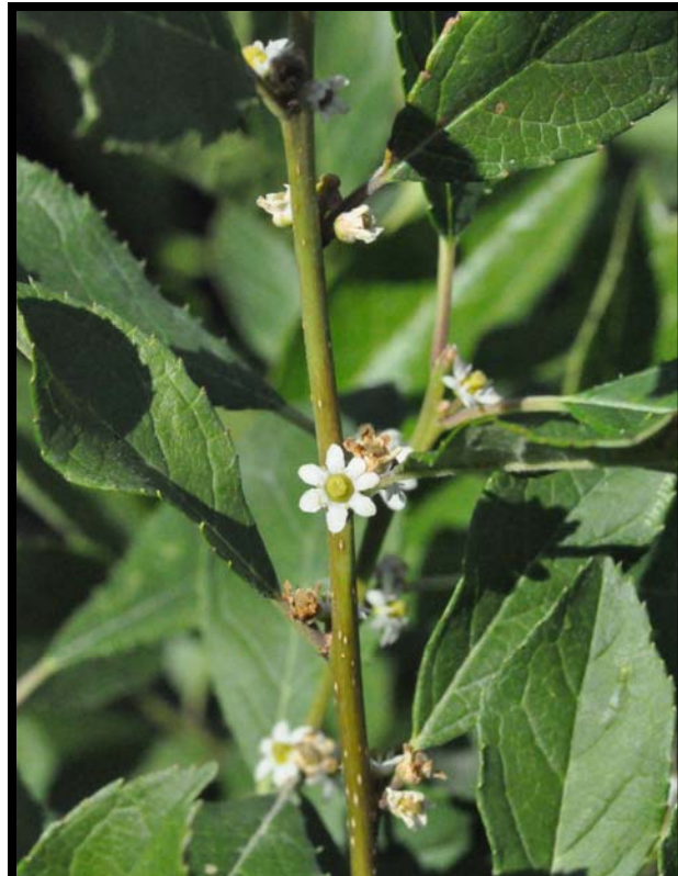
"The female flowers are in small clusters or alone - and have a green ovule in the center."

What winterberry does have in common with its holly relatives is that it is dioecious, meaning that both male and female parts are not on the same plant; rather, there are separate male and female plants. This is a very important point to be brought up when talking about using native plants in the home landscape.