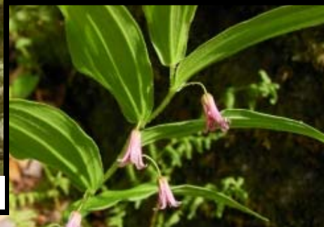
Rosy twisted stalk was fairly common on the east side of Mount Seneca.