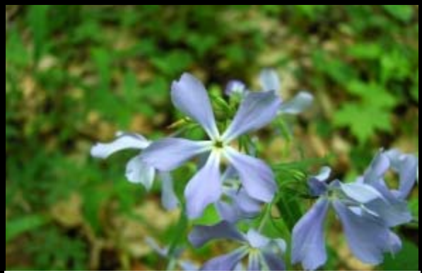
We saw a nice stand of Phlox divaricata .