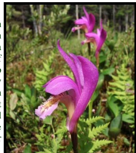
Arethusa in the Adirondacks